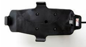
iPhone 4S, 4 with case