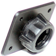
Lock Plate Item # BR-202LP