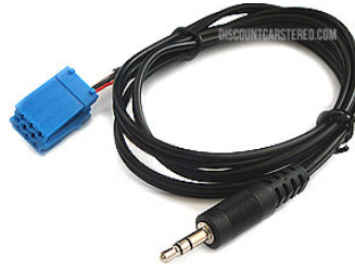
Aux Input cable for Becker CDR 220 www.discountcarstereo.com