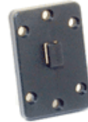
Portrait T-AMPS Adapter Clip for Satellite Radio MED Item # TS-01