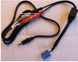
Aux Input cable for Becker CDR 220 www.swstereo.com