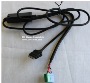
iPhone adapter cable for Becker CDR 220 www.swstereo.com