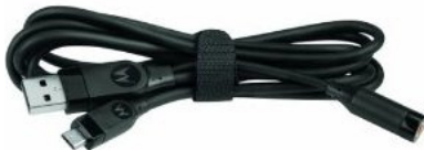
Motorola power and audio cable for Droid smartphones