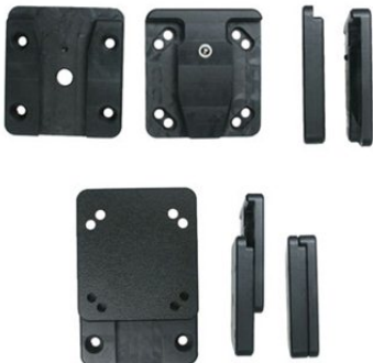
Device Mounting Adapter AMPS to AMPS slot plates Item # 21505 -