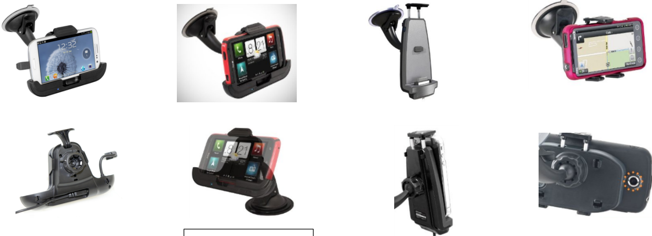
Samsung Galaxy S III

Note: These docks are configured with a locking ball/socket connection that inserts directly onto the 17mm ball in the PCAR MOUNT KIT