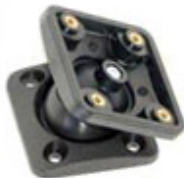
Easy Swivel Item # EZ-2026