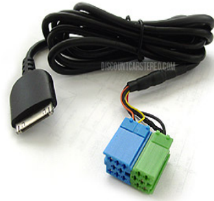
iPhone Adapter cable (iP- BKR2) for CDR 220 www.discountcarstereo.co