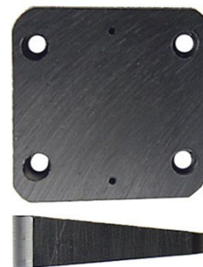
15 Degree Wedge Item # 215163