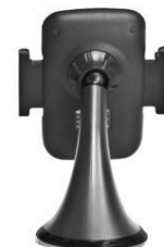
Arkon Slim-Grip Universal Holder

This dock connects to PCM-1000 Series using a T slot adapter plate