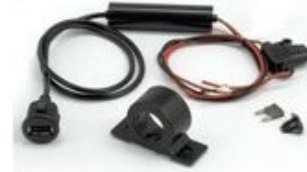
i-Simple HubVolt DM cable system for powering USB chargeable MEDs