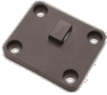
Landscape T-AMPS Adapter Clip for PanaVise Dock and Satellite Radio MED