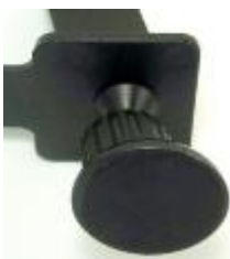
Universal Magnetic Connector

The PCAR MOUNT is purpose built for the classic Porsche 911 and is engineered for universal compatibility with M obile E lectronic D evice (MEDs) ... today's devices and those yet to come. We now have three pathways to mount your device: (1) universal magnetic mounting described herein; (2) ball/socket attachment to the milled aluminum 17 mm swivel ball plate in the kit which accepts many portable GPS appliances and most smartphone cradles/holders/docking units; and (3) direct cap screw attachment to the AMPS platform on the bracket (behind the 17mm ball plate) which is configured with the industry-standard, rectangular-spaced, AMPS hole pattern (38mm x 30mm) and accepts all kinds of device mounting hardware and adapters.