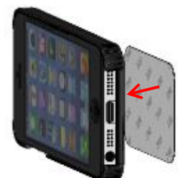
Back Surface of the Phone Case