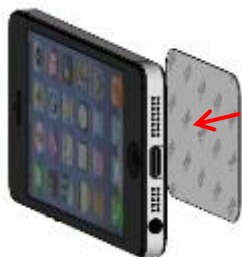
Back Surface of the Naked Phone