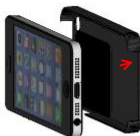
Inside Surface of the Phone Case (works best with thinner cases)