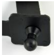
17mm Swivel Ball Plate