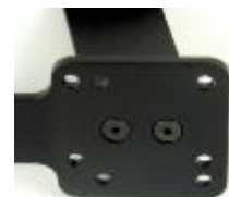
AMPS Hole-Pattern Platform (38mm x 30mm)